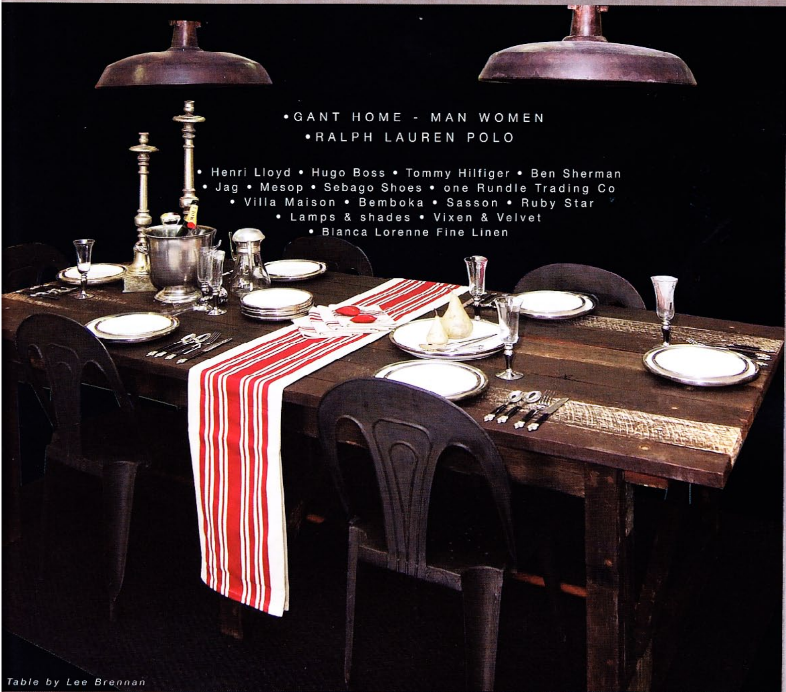
Table by Lee Brennan

Noosaville - shop 3, 5 gibson road noosaville ph 5474 1577 Noosa Classics - ladies wear 31 hastings street noosa heads ph 5473 5211 Cross Classics Menswear 37 hastings street noosa heads 5447 3124